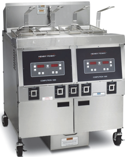
OFE 322 2-well electric open fryer with split vats and Computron™ 1000 control

Henny Penny open fryers offer high-volume, integral multi-well frying with programmable operation, oil management functions and fast, easy filtration.